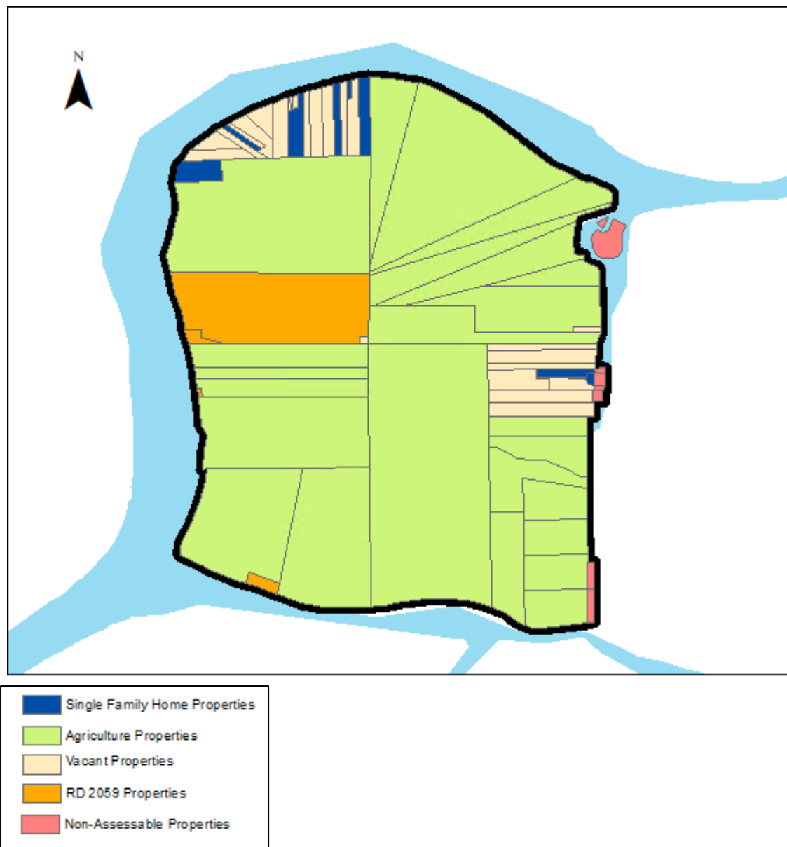
Figure 2 – Various Land Use Types on RD 2059