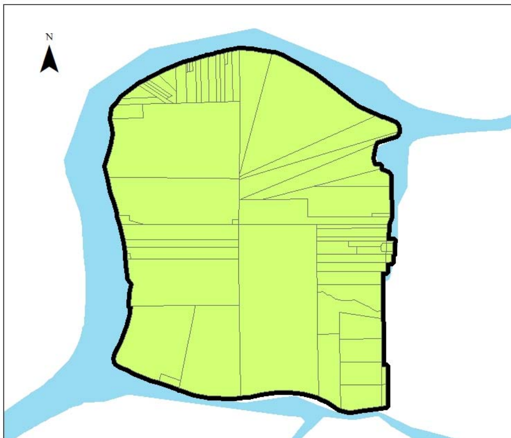
Figure 3 – Reclamation District 2059 Assessment Diagram FY 2022-23

FILED IN THE OFFICE OF THE CLERK OF RECLAMATION DISTRICT 2059, COUNTY OF CONTRA COSTA, CALIFORNIA, THIS ____ DAY OF _____, 20__.